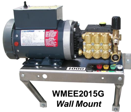
WMEE2015G Wall Mount