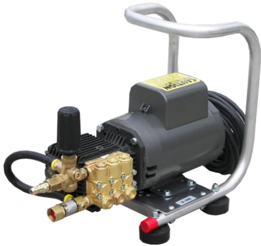
HCEE2015G Hand Carry